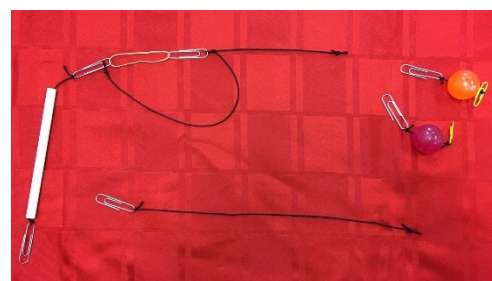
Figure 1: Centripetal Force Apparatus